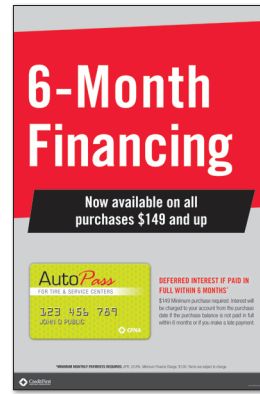
BENEFITS POSTER, 24" x 36"