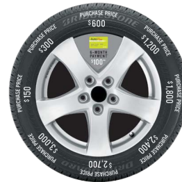
PAYMENT WHEEL 8" DIAMETER