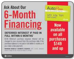
COUNTER MAT, 14" x 11"