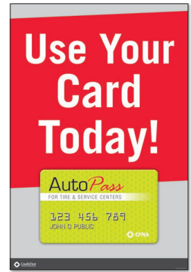
WINDOW DECAL, 24" x 36"